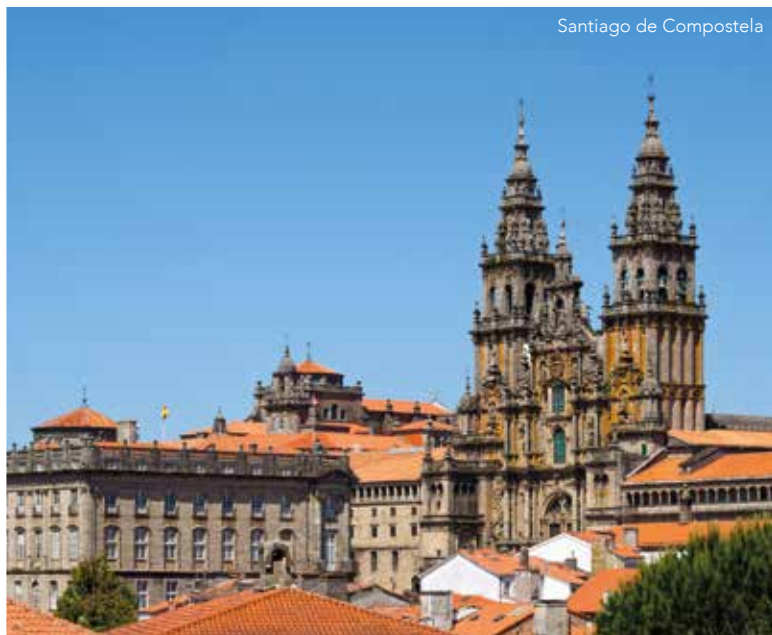
Santiago de Compostela