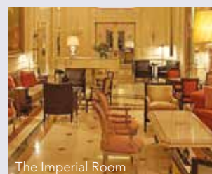
The Imperial Room