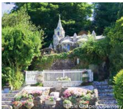
Little Chapel, Guernsey

French coast. Please note that we will be at anchor today and will use the vessel's Zodiacs to transfer ashore.