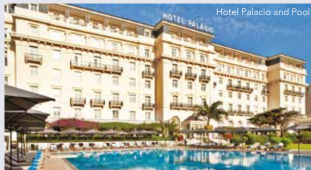
Hotel Palacio and Pool

For those who would like to spend some time in Portugal prior to embarking the MS Island Sky, we have arranged a three-night extension at the beautiful Palacio Estoril Hotel, located a short distance from Lisbon. Our stay will include a half day tour of Lisbon and a half day tour of Sintra and the remainder of the time will be yours to explore at leisure.