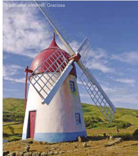
Traditional windmill, Graciosa