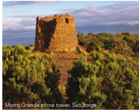
Morro Grande stone tower, Sao Jorge