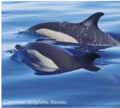
Common dolphins, Azores