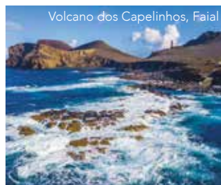
Volcano dos Capelinhos, Faial

Disembark this morning. Transfers will be provided to Portsmouth Harbour Railway Station and our departure London airport at a fixed time.