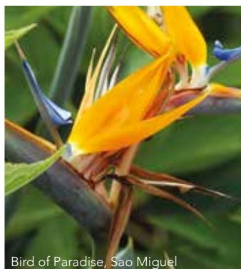
Bird of Paradise, Sao Miguel