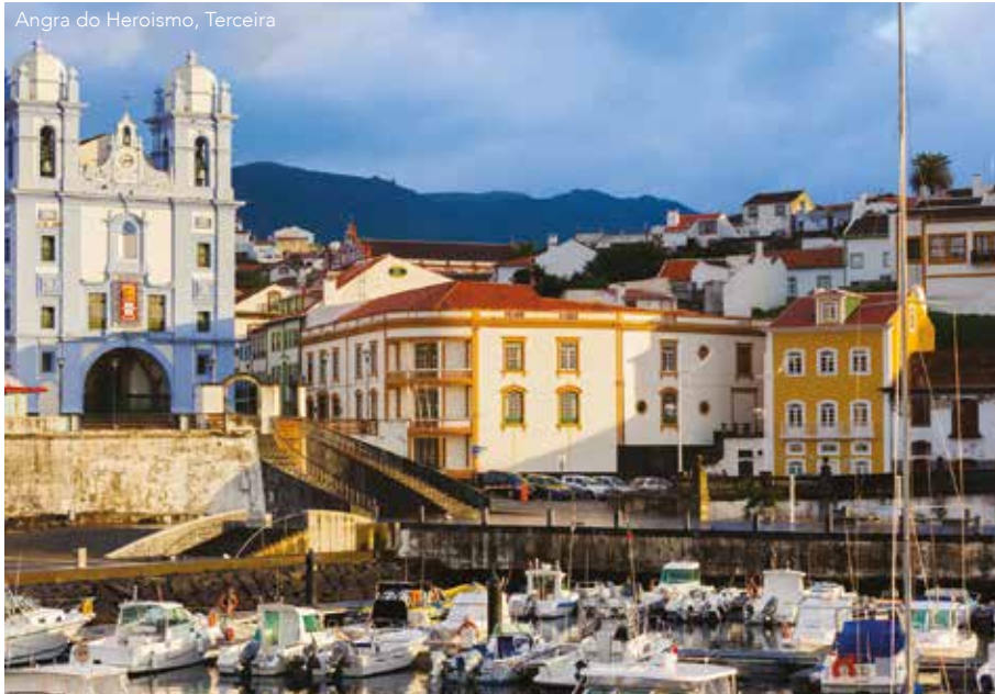
Angra do Heroísmo, Terceira