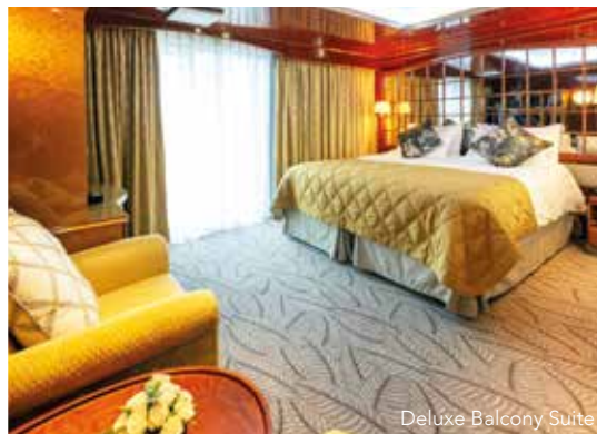
Deluxe Balcony Suite